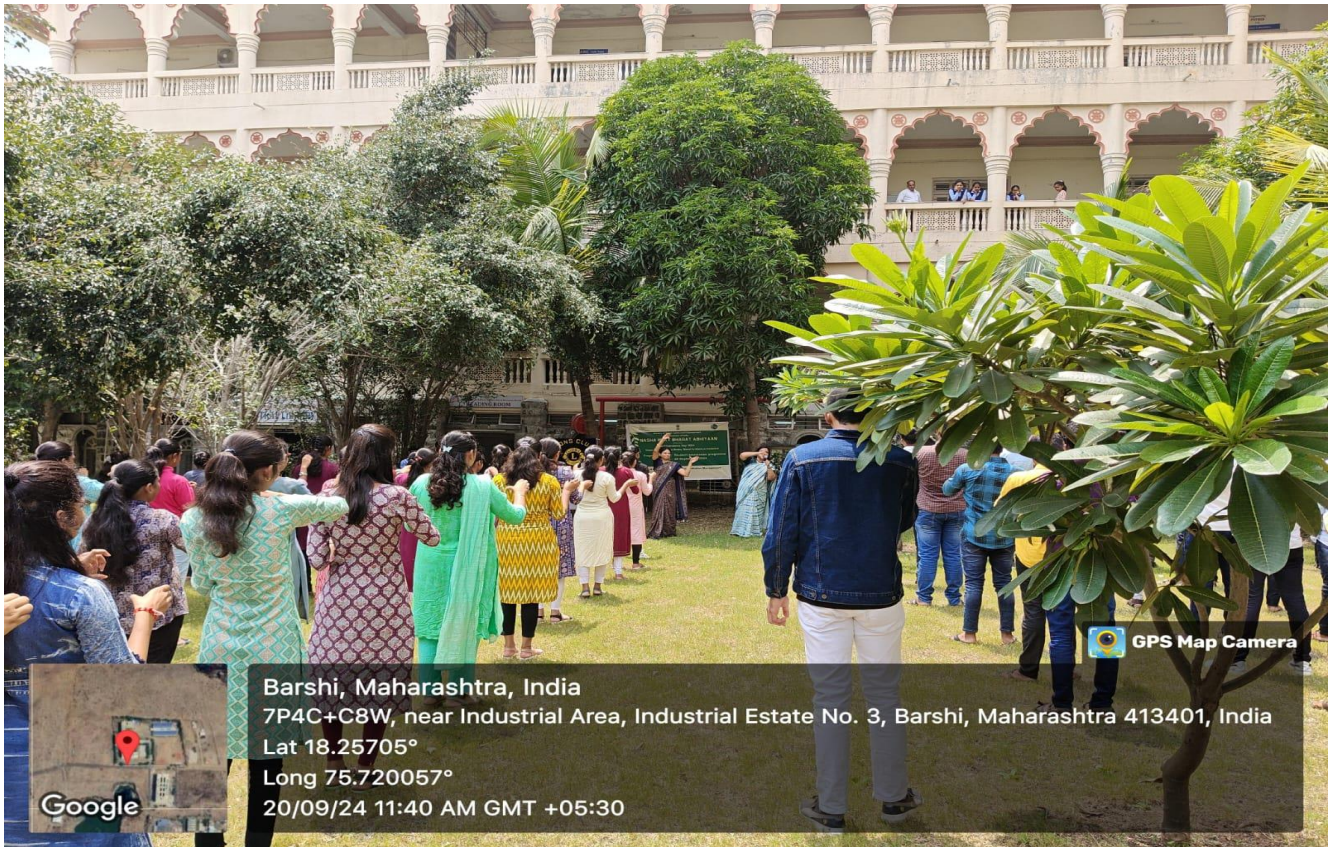
Team of Ayush Institute carrying out Zumba dance session with students