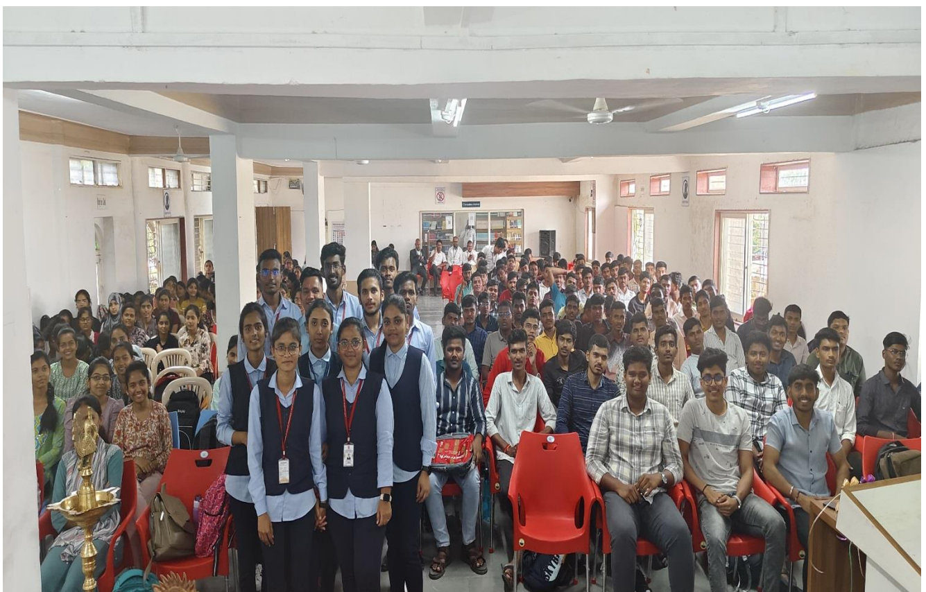
Interaction of Newcomers with Senior Students