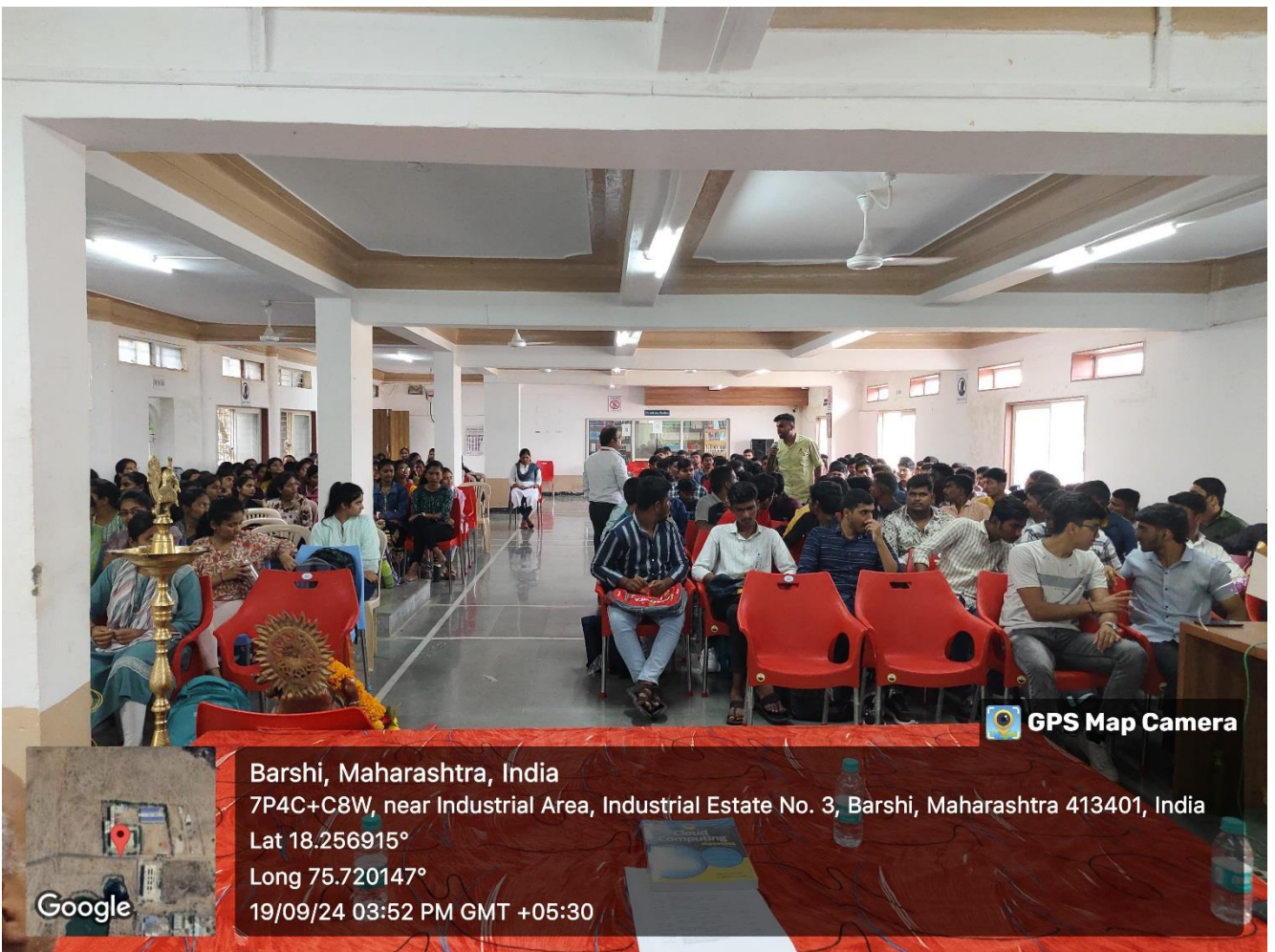
Departmental presentations by respective HODs of CE /CSE / ME/ EnTC /ECE departments