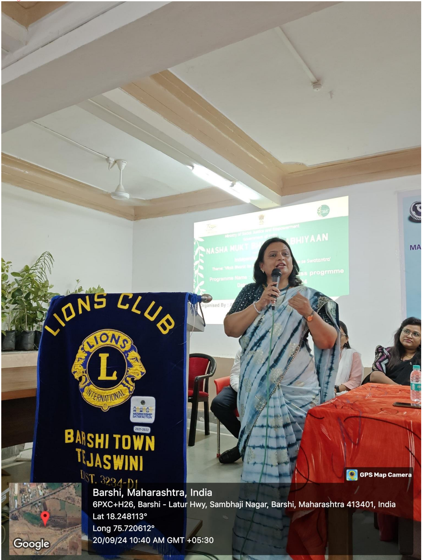
Representative of LIONS CLUB TEJASWINI Barshi Town addressing the students on 'Nasha Mukta Bharat Abhiyan'