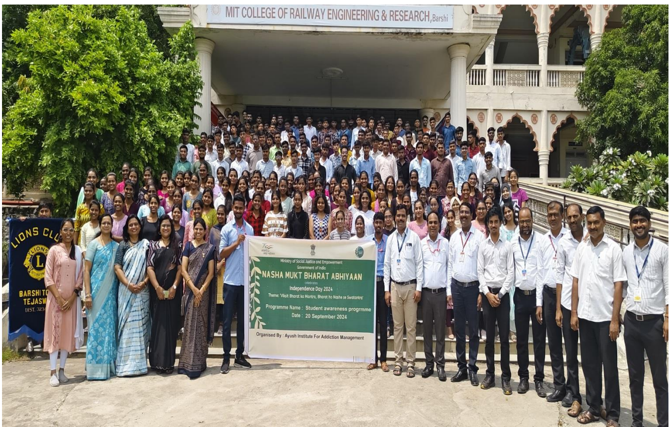
Students supporting Nasha Mukta Bharat Abhiyan